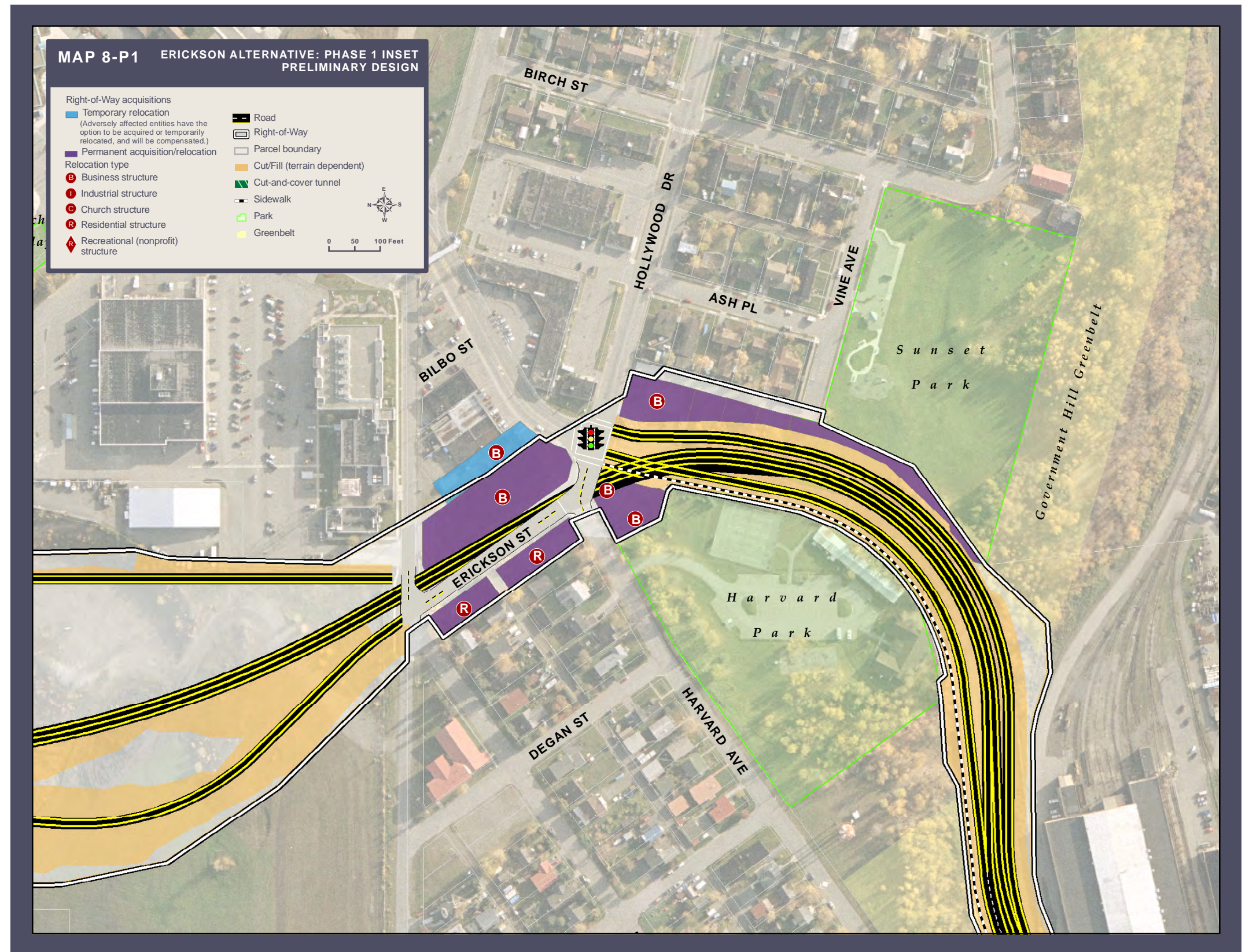
Exhibit S-12 Recommended Alternative — Map 8-P1, Anchorage Side in Phase 1 (enlarged)