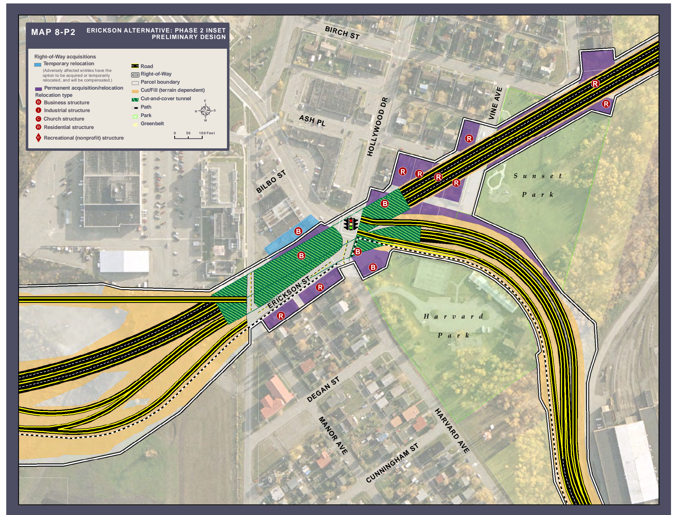
Exhibit S-14 Recommended Alternative — Map 8 P2, Anchorage Side in Phase 2 (enlarged)